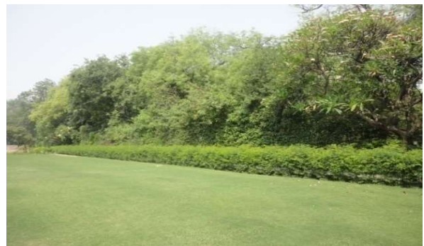
Figure 6: Showing shady trees