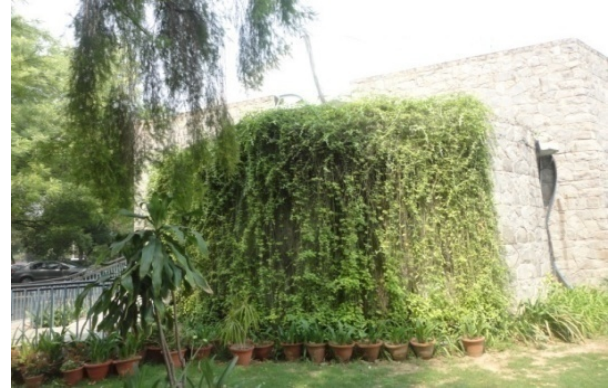
Figure 11: Climbers on southern wall