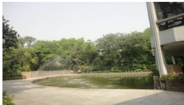
Figure 7: Water body to improve thermal comfort