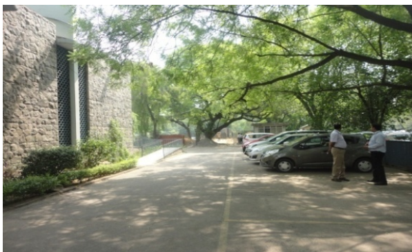
Figure 10: Deciduous trees as shading device

Climbers are used to reduce cooling load within the building on South side. Deciduous trees are planted in the south direction to provide relief in summers and provide sun in winters.