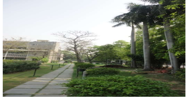
Figure 5: Row of trees on Eastern side