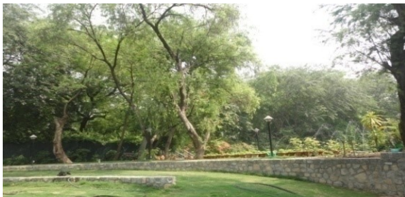
Figure 9: N-W view