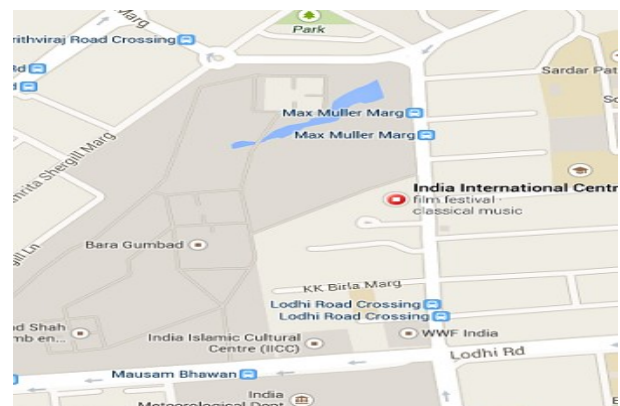
Figure 1: Location of site

Architect & Planner: Ar. Joseph Allen Stein