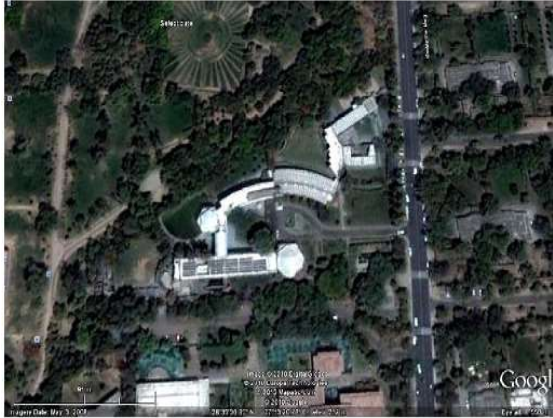
Figure 2: Ariel view of site