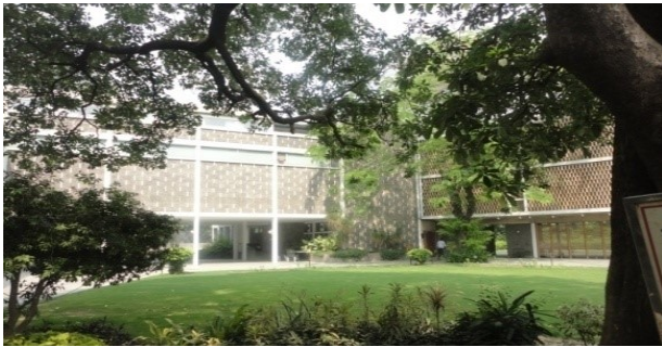
Figure 8: Open Air Theatre with trees channelizing N-W breeze

Interior landscaped courtyards with Shady Trees and mounds containing shrubs and groundcovers make the inner courtyard airy and shady.